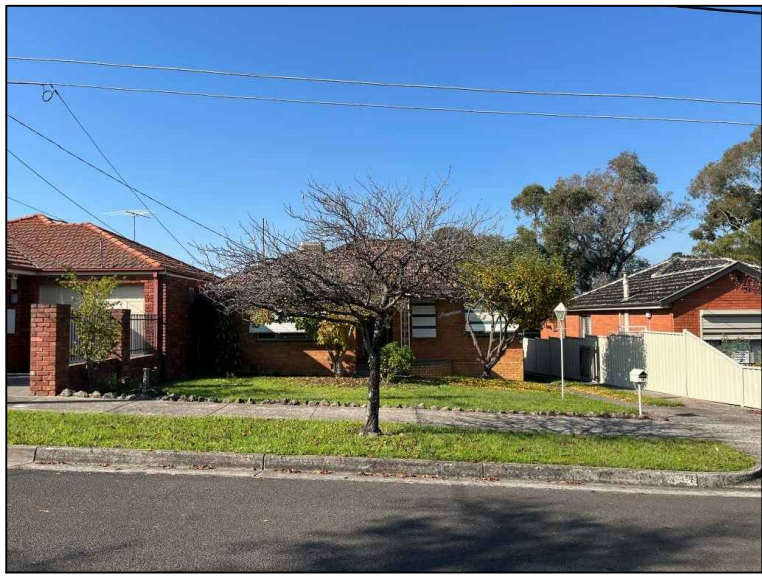
LOT 69, 14 HOPETOUN AVENUE, RESERVOIR